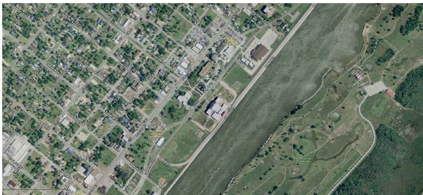
Figure 1: Lamar State College Port Arthur Campus

Lamar State College Port Arthur (LSCPA), a two-year, state-supported institution, is located in Port Arthur, an industrial and cultural center of Southeast Texas. The College offers freshman- and sophomore-level work in numerous academic and technical/vocational fields. The campus sits between the 1000 and 1800 blocks of Procter Street and Lakeshore Drive and is immediately adjacent to the Sabine-Neches Intercostal Waterway.