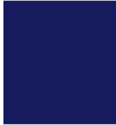
Pantone 296 C100, M99, Y32, K27